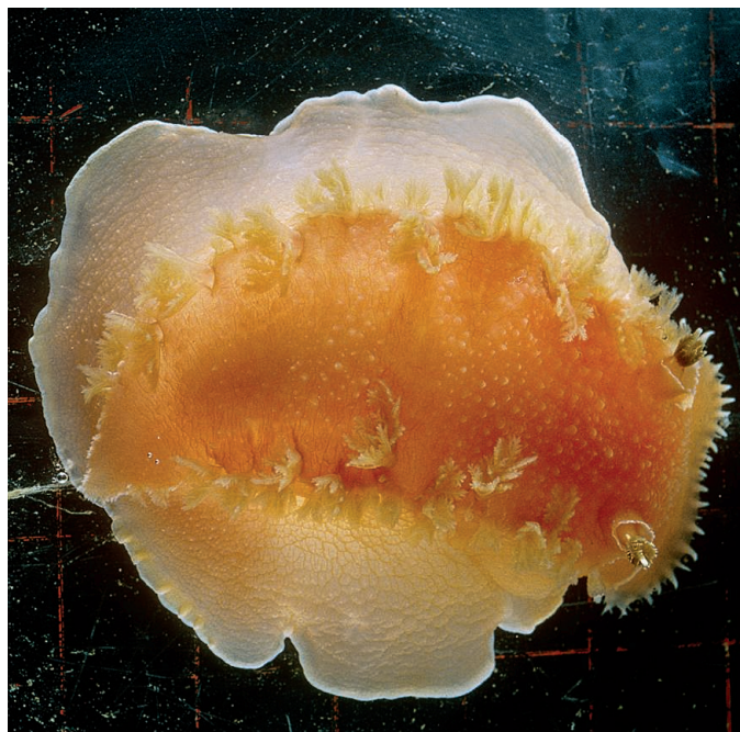
Changes in the neuronal network may consolidate memory, as seen in the Rosy Tritonia