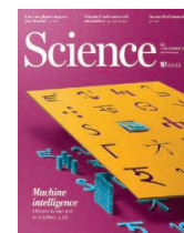
Illustration of character sorting by a computational model (tall piles, simple characters; short piles, more complex ones). People learn to recognize and draw simple visual concepts

(such as a letter in a foreign alphabet) from only a few examples, whereas machine learning algorithms typically require tens or hundreds of examples. See page 1332 for more on representing concepts as programs that can generate a range of new letters.