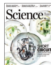
Illustration of a functional T cell (background) and an exhausted T cell (foreground). When responding to chronic infection or cancer, T cells become exhausted and lose many of their core functions. This process involves a fundamental “rewiring” of the cellular regulation of gene expression. Thus, exhausted T cells likely represent a distinct cell lineage. See pages 1104, 1160, and 1165.