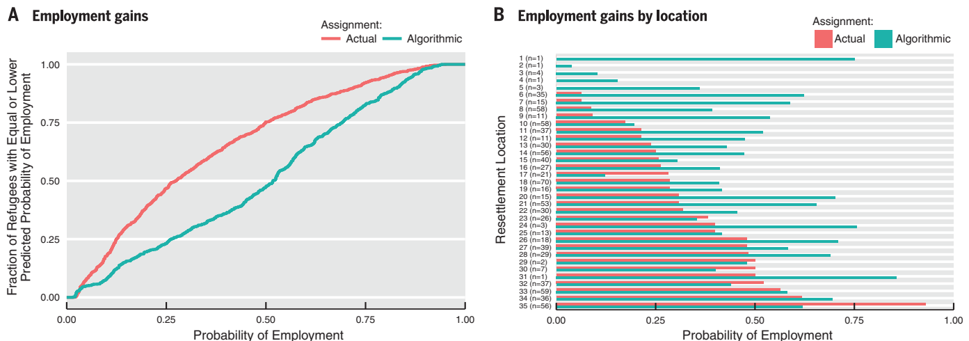
Fig. 2. Employment gains from data-driven refugee assignment in the United States. (A) Empirical cumulative distribution functions (ECDFs) of the refugees’ predicted 90-day employment probabilities under their actual and algorithmic assignments. (B) Actual and algorithmic employment rates by resettlement location.

Our approach also preserves the ability of policy-makers to set their own parameters and priorities. Specifically, policy-makers can choose their