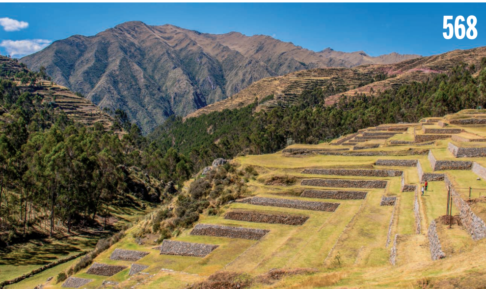
Incan terraces in the Sacred Valley of Peru, which has become a major tourist destination