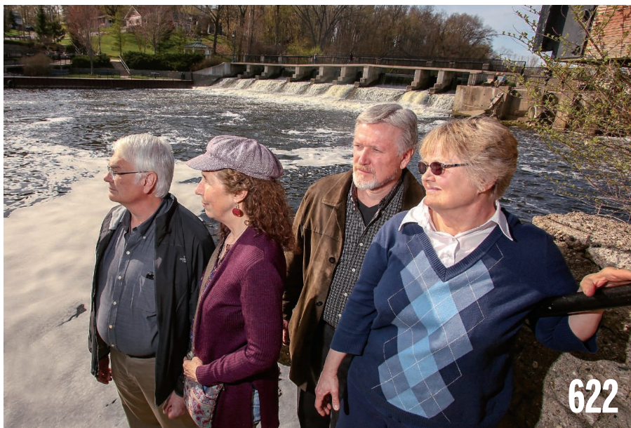
A grassroots campaign led to the discovery of PFAS contamination in Michigan's Rogue River and beyond.