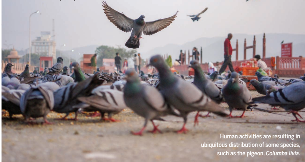
Human activities are resulting in ubiquitous distribution of some species, such as the pigeon, Columba livia .

they fabricated out of glassy carbon. Under optimal conditions with a spinodal topology, the propagation of cracks is impeded as they do not align with the stress direction. This enables a slow, progressive failure during impact, and thus higher energy absorption. —MSL