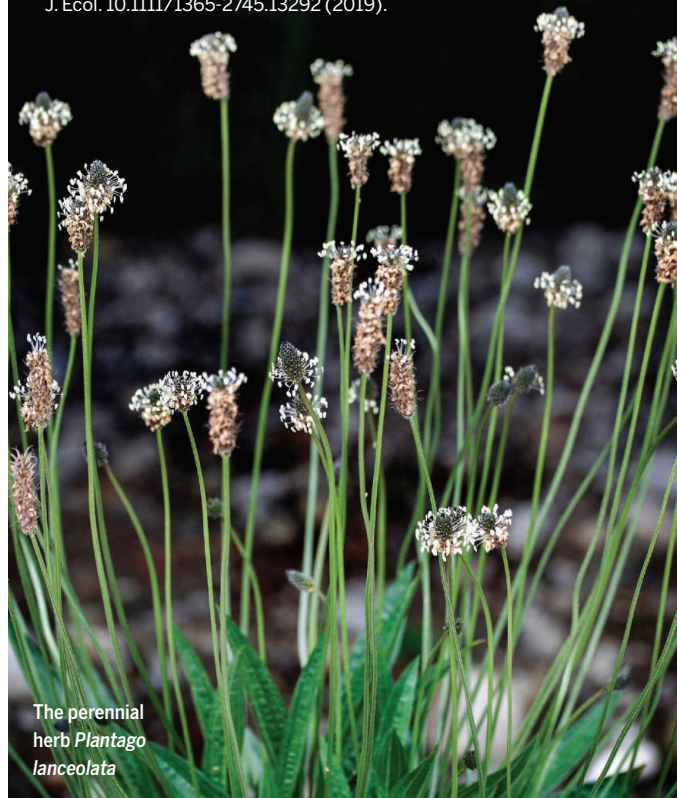
The perennial herb Plantago lanceolata

J. Ecol. 10.1111/1365-2745.13292 (2019).