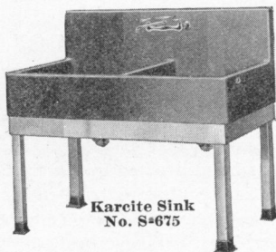
Karcite Sink No. S-675

There are many standard Karcite Sink designs available and any special designs desired can be made to your specifications. Write for KARCITE Catalog. Karcite Sinks are now distributed by most leading Laboratory Furniture manufacturers.